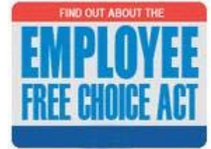
click image for more info