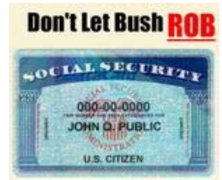
click image to learn more

» PA Home » PA Online Edition » August Print Edition Subscribe to PA