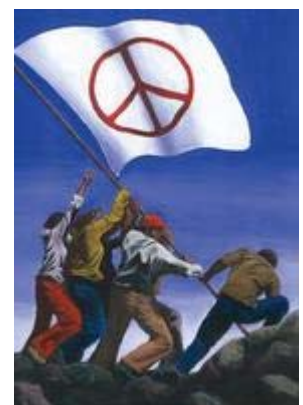
click to purchase post cards with this image