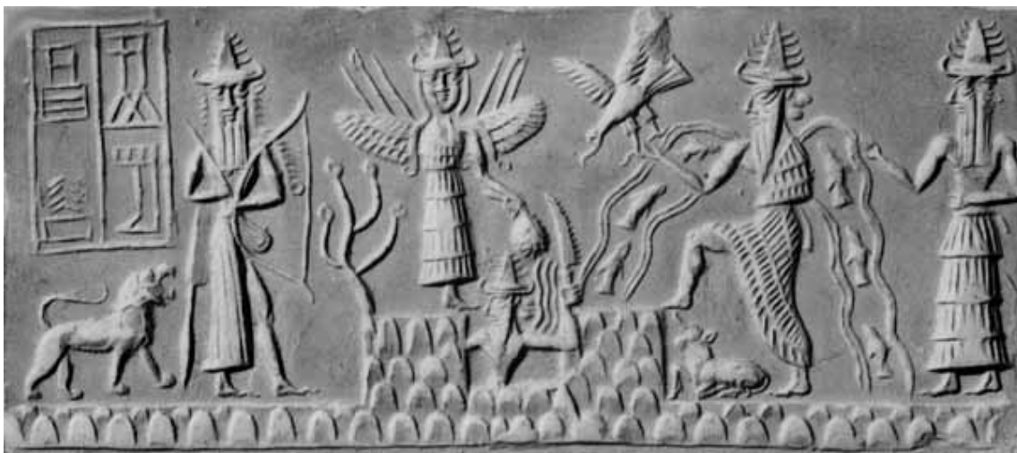
Sumerian Gods Allegedly Create a Biogenetic Experiment