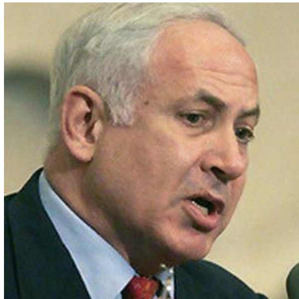
Netanyahu decided not to attend a conference in London after the pre-attack warning