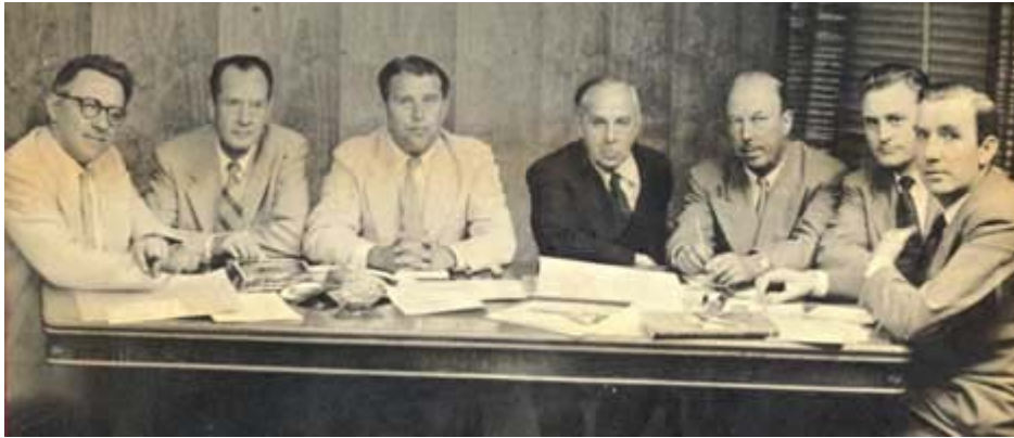
Moonfakers at work for Collier's magazine

(And why haven't we been back to the moon in 42 years?)