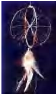
All Nations Dream Catchers

sound can make plants grow faster, more fruitful. healthier, stronger, more nutritious, with longer shelf life. Over 20 years of making plants and growers happy.