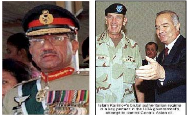
Pakistan's Musharraf, US Uzbekistan's tyrant, Islam General Tommy Franks Karimov

that supported the friends of a family who loved a who lived in a house that Bush bombed