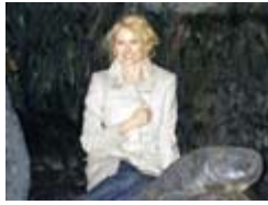
King Kong premieres in New York