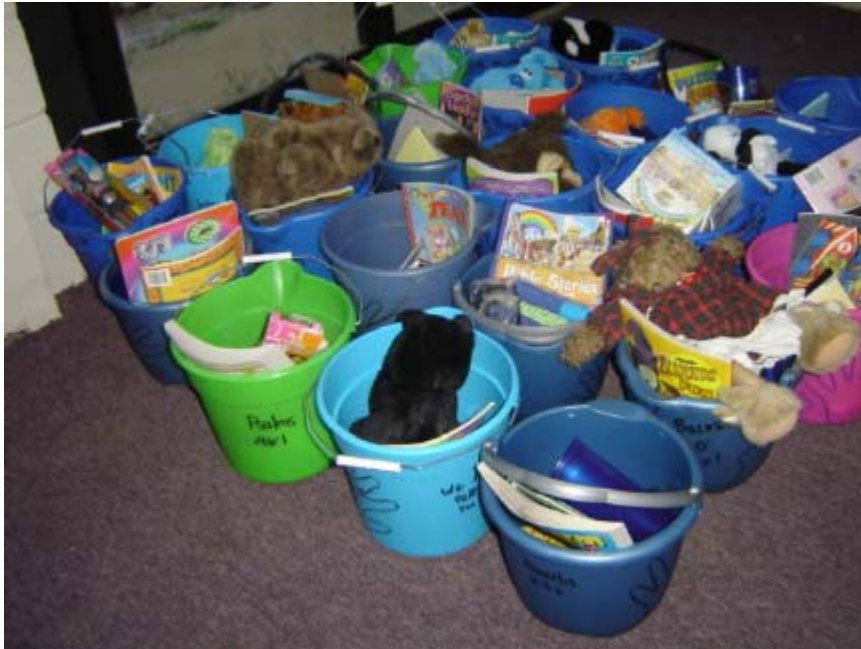
And a dorm room: