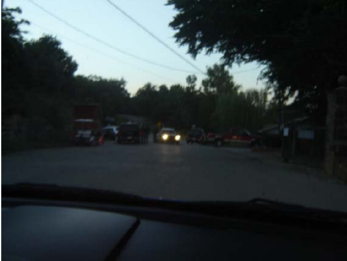
More OHP vehicles parked at the rear gate as we pass by: