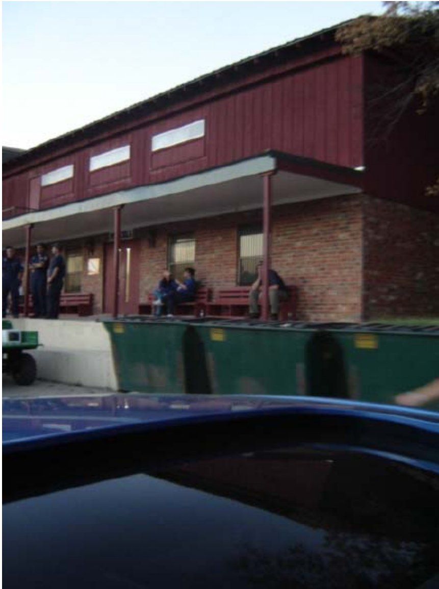
This is just one OHP car in a long line of them parked along the side of the street.