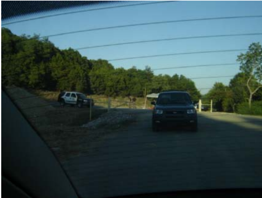
We made our way through the narrow streets toward our church's cabin.