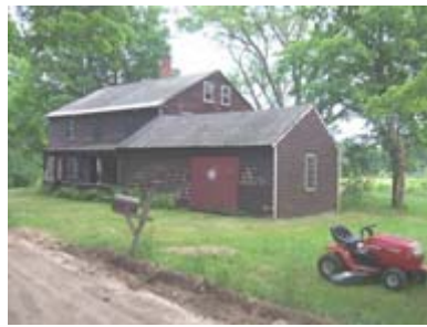
New Hampshire home of Justice David Souter