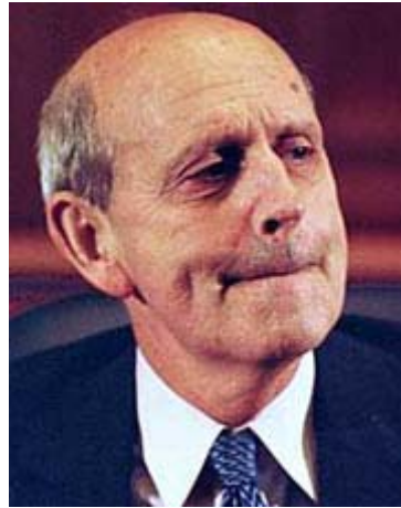
Justice Stephen Breyer

Public outrage over the recent Supreme Court ruling allowing governments to seize private property and