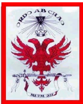
Order Out Of Chaos

"BY WAY OF DECEPTION THOU SHALT DO WAR" - MOSSAD LOGO in Hebrew