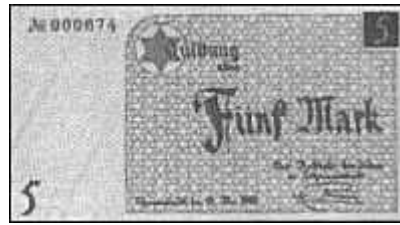
Lodz ghetto money.