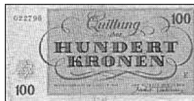
These beautiful Theresienstadt notes, complete with watermarks, demonstrate the high-quality artwork and printing of the money.