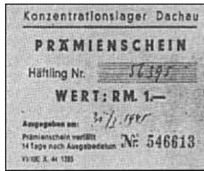
A Dachau camp note.

tokens were of three different values: 1, 2 and 3 marks. The prisoner's identification number is written on the front of this green note, alongside the date when it was issued, January 31, 1945. In fact, all of Dachau's tokens list the prisoner's identification numbers." Stahl, pp. 18- 19.