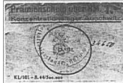
An Auschwitz camp note.

"At a death camp it would seem that there was very little need for money." ( The Shekel , Vol. XVI, No. 2, March-April 1983, p. 43.)