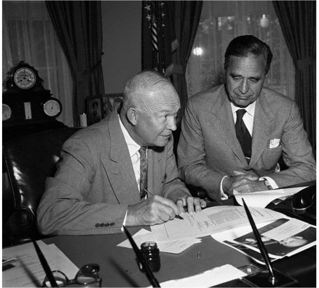
Prescott Bush with President Dwight Eisenhower

+ Prescott Bush advised Eisenhower to run for President and then launched the Richard Nixon Vice Presidency. Subsequently he was a major financier of Nixon's presidential campaign. Prescott Bush was an avid JFK opponent and Nixon has always been in the interests of the Bush family. To read the details click here .