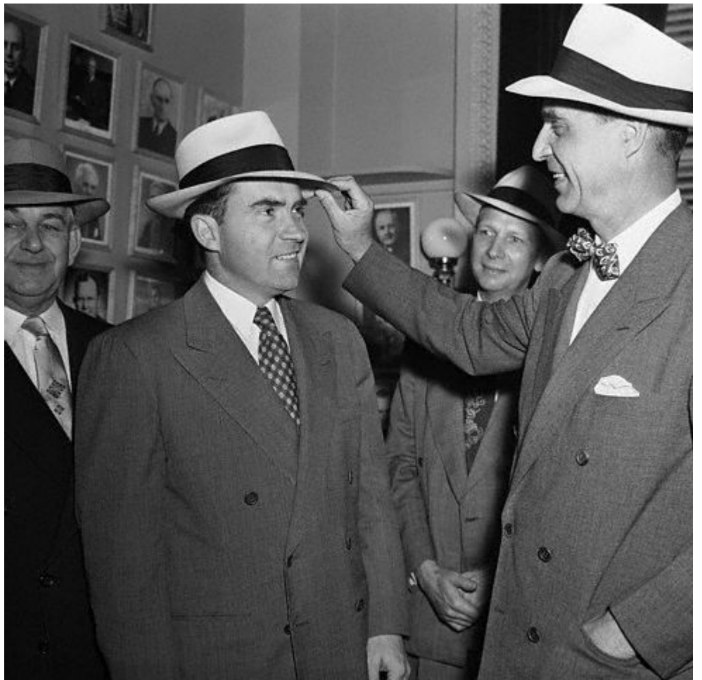
Prescott with his protégé Dick Nixon