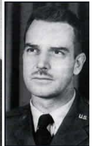
David Atlee Phillips and Edward Lansdale