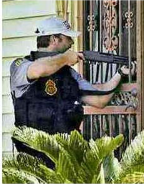
Hired by Chertoff

Blackwater Mercenaries Have Been Issued State ID's