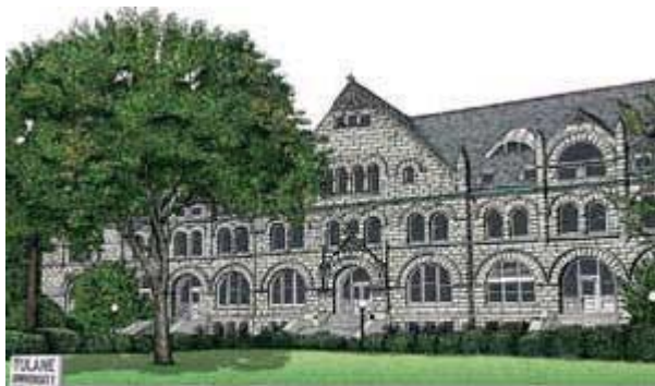
Tulane University, New Orleans, La.