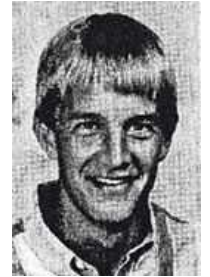
Young Erik Prince

Here is a video showing these killers in action. Even the army is afraid of them.