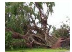
PHOTO GALLERY Reader submitted photos from Hurricane Katrina