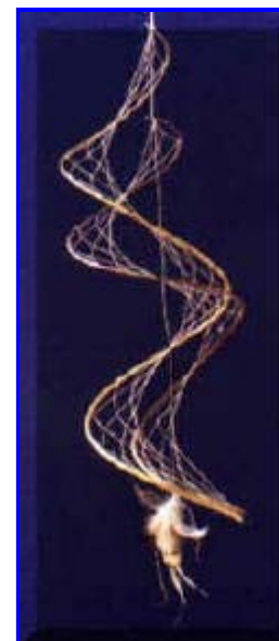
Dream Catchers of the 7th Fire

[Added note: The unelected Bush regime is full of oil industry people, and the Bush family has long been involved in the oil business. George Bush Senior was also Director of the CIA under President Ford, from 1974-76.]